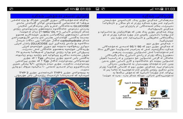
Figure 4 The General overview of diabetes.