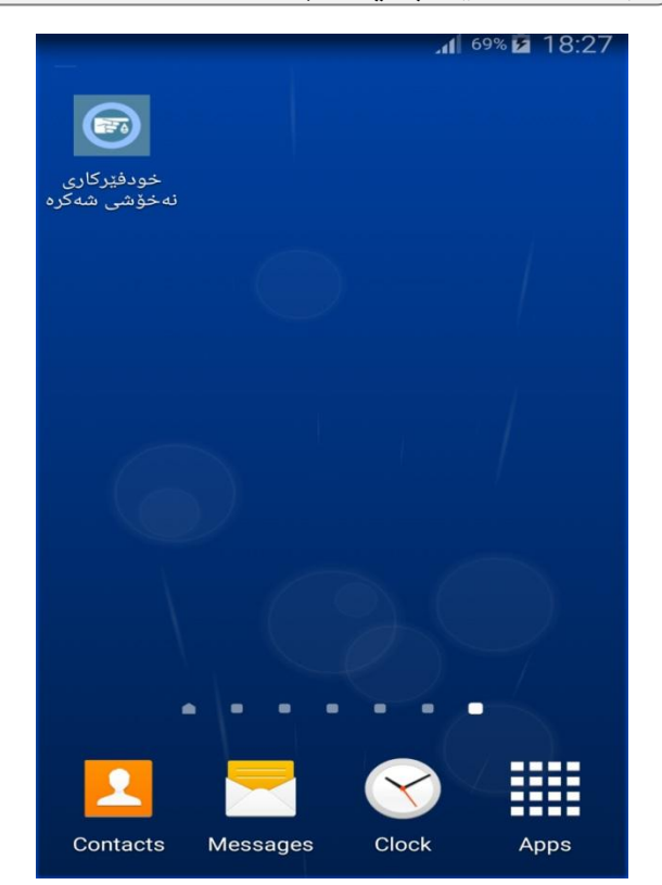
Figure 10 Diabetes self-treatment education program on the mobile phone

مجلة جامعة التنمية البشرية / المجلد2/العدد 3/ آب 2016