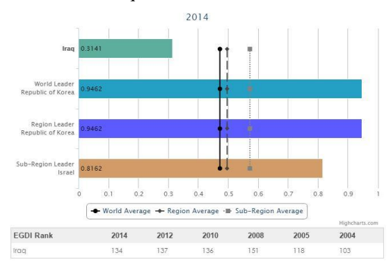
Figure 2: e-Government development index [16]

in the global ranking from being ranked 151st in 2008 to 136<sup>th</sup> in 2010, this ranking indexed between 193 countries. The government of Iraq achieved a good development in e-Government services because the 2008 survey and being above the 2010 world average (0.2996). Furthermore, in terms of the e-Participation index, for instance Iraq had the best move upwards all over the world from being ranked 151st in 2005 to 60th in the 2008 survey [16]. However, this number was unbelievably rapidly increased to 101st in 2012 and 152nd in the 2014 survey because of economical issues. In 2014 Iraq has been ranked 134th out of 193 of the Western Asia countries for the readiness index, with an overall index of out of 1.0, of which, 0.2173 telecommunication infrastructure component, 0.1969 for online service component and 0.9619 for human capital component [16]. Below figure shows the UN ranking index in 2014 about Iraqi e-Government.