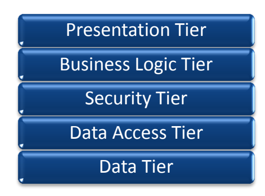
Fig. 2. The proposed N-Tier framework architecture.

The basic idea behind this layered architecture is to encapsulate the security-relevant functions and separate them from other operational functionalities and applications. Thus, an e-government application delegates the security functions to the security layer, i.e. the application needs not be aware of the implementation details. Typically, the application only needs a few basic security-related functions such as [21]: